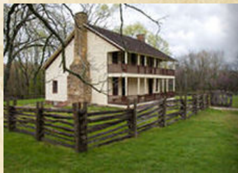
Elkhorn Tavern, 2008.

The Elkhorn Tavern was built sometime in the first part of the 19th Century and was in the middle of the Battle of Pea Ridge, fought on March 7 and 8, 1862. This is from "In the Shadow of the Hills".