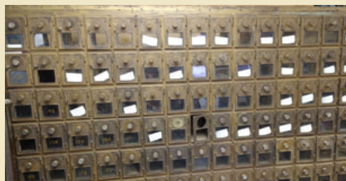
Old postal boxes