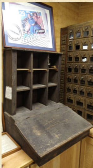
1920s Postal Desk from the Row Post Office